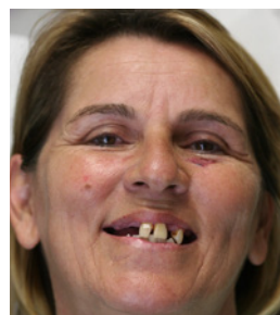
Cross before dental care

“I have a job now working with the public and it helps in providing for my granddaughter. But, the part that it has impacted most is my self-esteem. It gave me back my self-worth and confidence. I wake up and smile first thing in the morning, amazed that I found a place that cares enough to help people that can’t afford good dental health.”